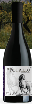
Nono's Blend PINOT NOIR NORTH COAST

In this Sauvignon Blanc you will savor hints of green apple and honeydew. It is a nice crisp and citrusy old style sauvignon blanc.